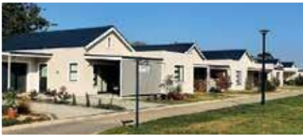
THE PLETTENBERG MANOR, PLETTENBERG BAY