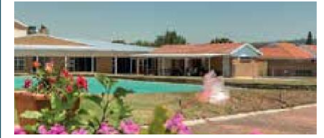
LEGATO RETIREMENT VILLAGE, DURBANVILLE