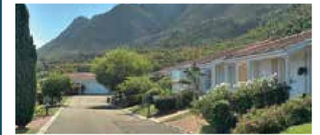
ONRUS MANOR, HERMANUS