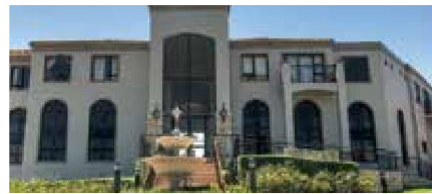
VILLA CORTONA, DURBANVILLE