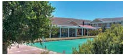
LA VIE EST BELLE, DURBANVILLE