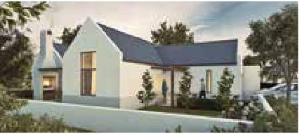
LANGEBAAAN MANOR, LANGEBAAAN