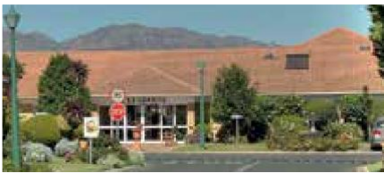
HERITAGE MANOR, SOMERSET WEST