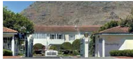
CLE DU CAP RETIREMENT VILLAGE, KIRSTENHOF