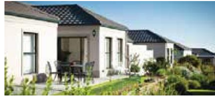
HELDERBERG MANOR, SOMERSET WEST