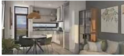
DE ZWARTLAND MANOR